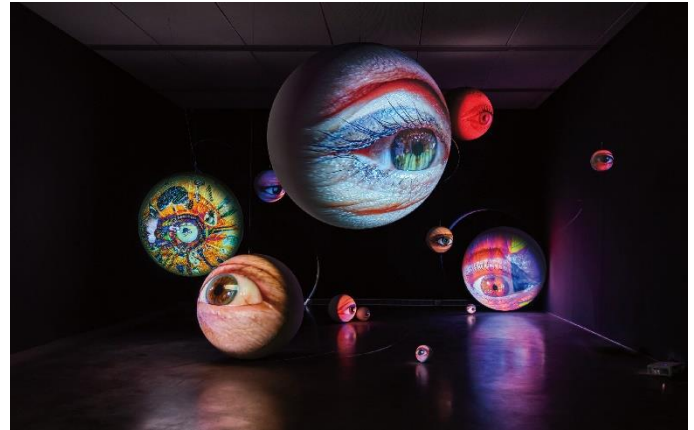
Specular 2021 Mock up of Specular

An installation of various sized eye spheres floating in the darkness. Surrounded by a swarm of giant eyes, the viewer sees media reflection of the surfaces of the eyes and experiences a cycle of being looked at and seeing themselves. This work questions the position of the viewer in contemporary visual culture. The eye is an important motif for Oursler, who says that it symbolizes our insatiable desire to consume images and stories. This is an ongoing project in which he has been exploring the eye motifs since 1995, constantly updating its themes and expressive techniques.