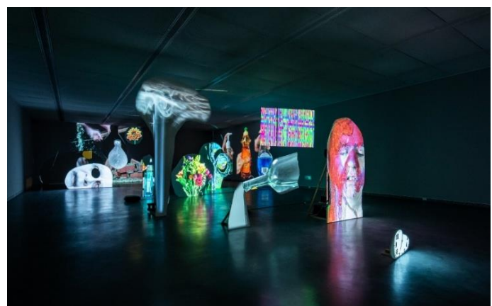
Lock 2, 4, 6 2010 Installation view, exhibition Tony Oursler: Black Box , Kaohsiung Museum of Fine Arts, Kaohsiung, Taiwan, 2021

Oursler, who is also deeply interested in psychology, has created one of his most ambitious meta-installations, inspired by psychological experiments. Projected onto a densely constructed layer of various differently shaped planes, the installation explores how viewers shape their perceptions and misperceptions through the whispering voices of drag performers and other archetypal characters. Liquid spills, cigarette smoke wafts through the air, and scratch cards are endlessly lost... This installation will prompt questions about willpower, fear, obsession, and the fragile structure of the self.