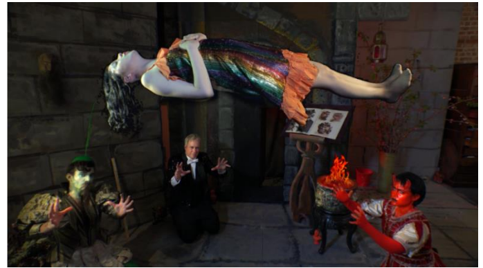
Imponderable 2015-2016 Installation view, The Museum of Modern Art, 2016

*A visual trick that uses translucent glass and special lighting techniques to make ghostly, insubstantial images appear.